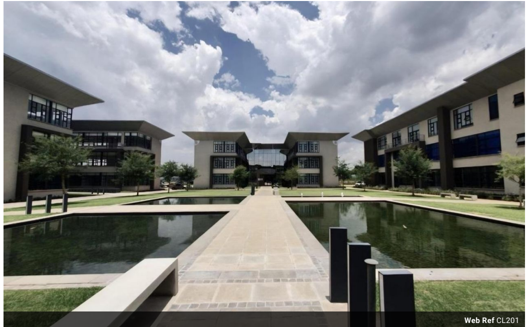
Web Ref CL201

Ground Floor The Place 1 Sandton Drive Sandton 2196