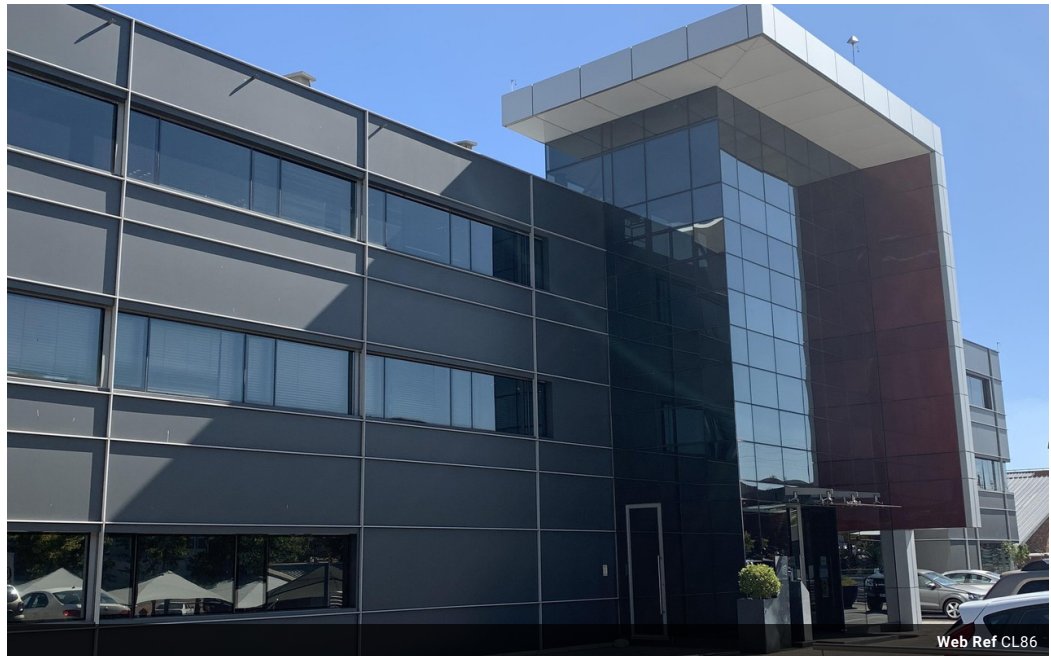
Web Ref CL86

Ground Floor The Place 1 Sandton Drive Sandton 2196