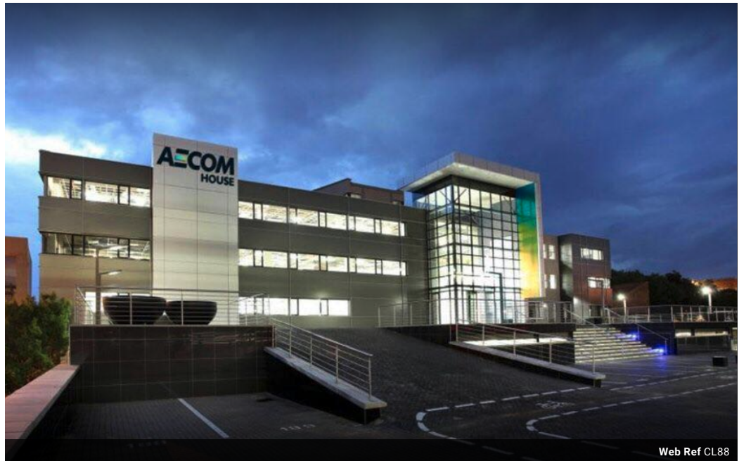
Web Ref CL88

Ground Floor The Place 1 Sandton Drive Sandton 2196