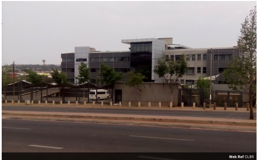
Web Ref CL89

Ground Floor The Place 1 Sandton Drive Sandton 2196