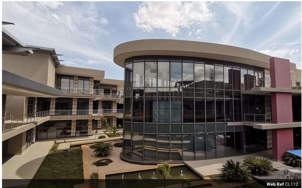
Web Ref CL112

Ground Floor The Place 1 Sandton Drive Sandton 2196