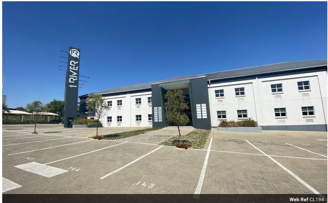
Web Ref CL194

Ground Floor The Place 1 Sandton Drive Sandton 2196