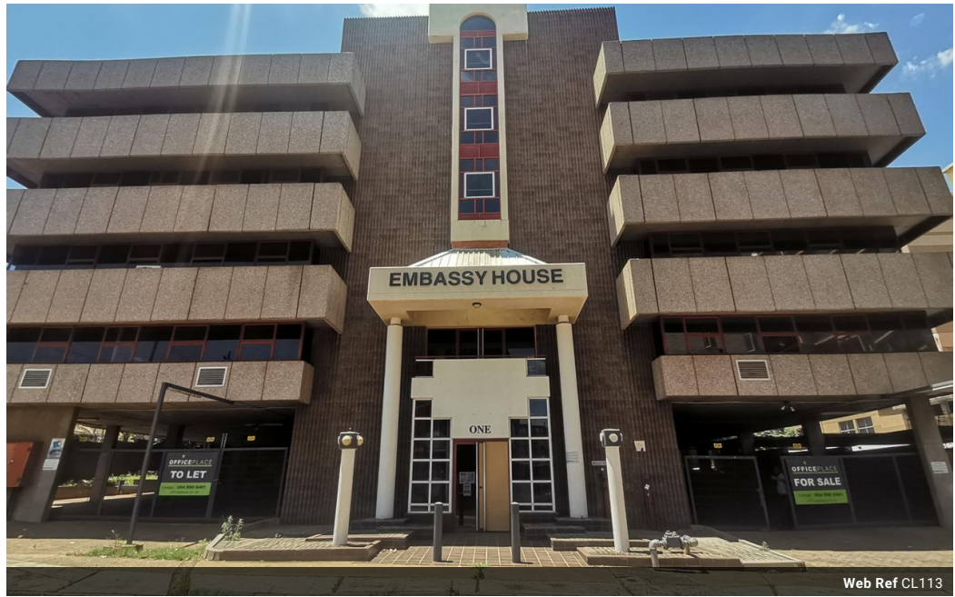
Web Ref CL113

Ground Floor The Place 1 Sandton Drive Sandton 2196