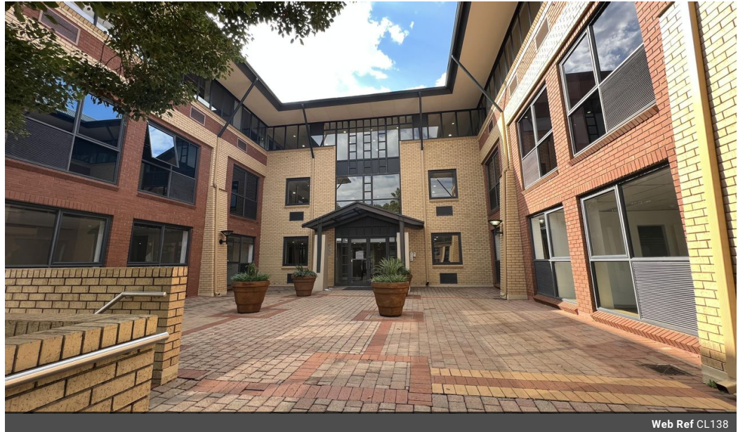
Web Ref CL138

Ground Floor The Place 1 Sandton Drive Sandton 2196