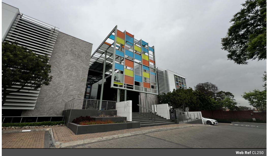
Web Ref CL250

Ground Floor The Place 1 Sandton Drive Sandton 2196