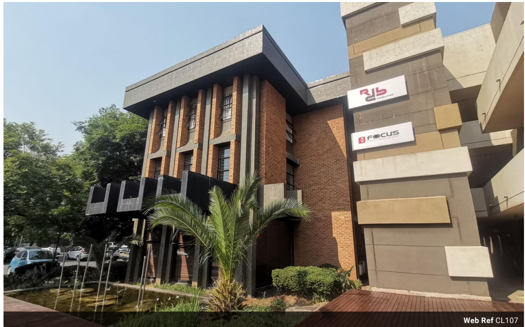
Web Ref CL107

Ground Floor The Place 1 Sandton Drive Sandton 2196