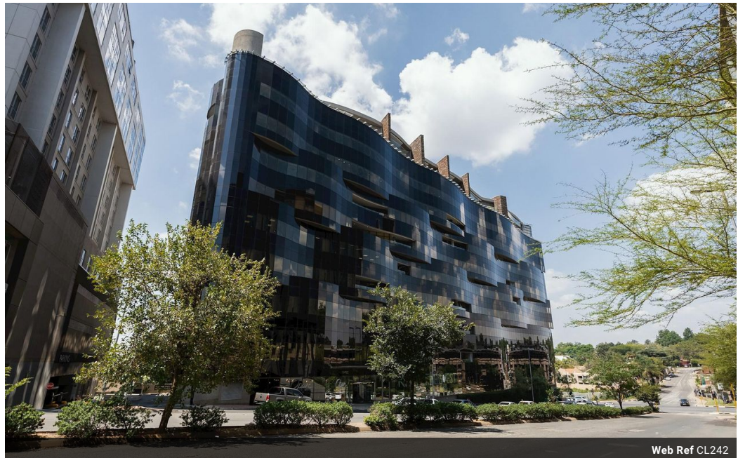
Web Ref CL242

Ground Floor The Place 1 Sandton Drive Sandton 2196