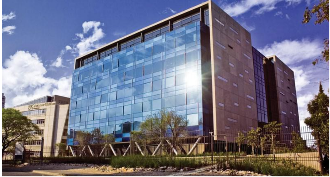
Web Ref CL42

Ground Floor The Place 1 Sandton Drive Sandton 2196