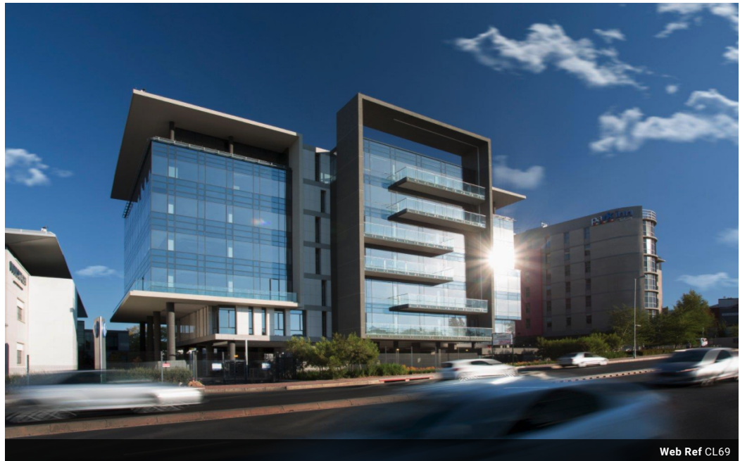
Web Ref CL69

Ground Floor The Place 1 Sandton Drive Sandton 2196