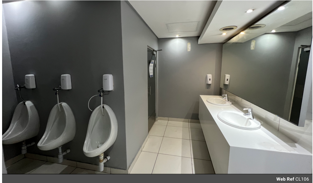
Web Ref CL106

Ground Floor The Place 1 Sandton Drive Sandton 2196