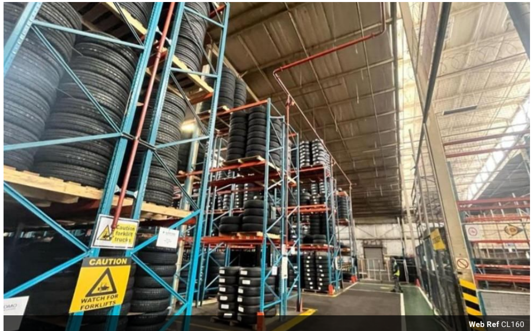
Web Ref CL160

Ground Floor The Place 1 Sandton Drive Sandton 2196