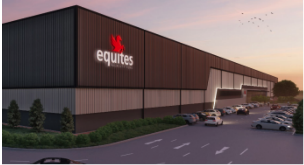
Web Ref CL50

Ground Floor The Place 1 Sandton Drive Sandton 2196