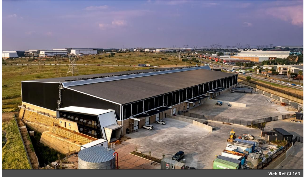
Web Ref CL163

Ground Floor The Place 1 Sandton Drive Sandton 2196