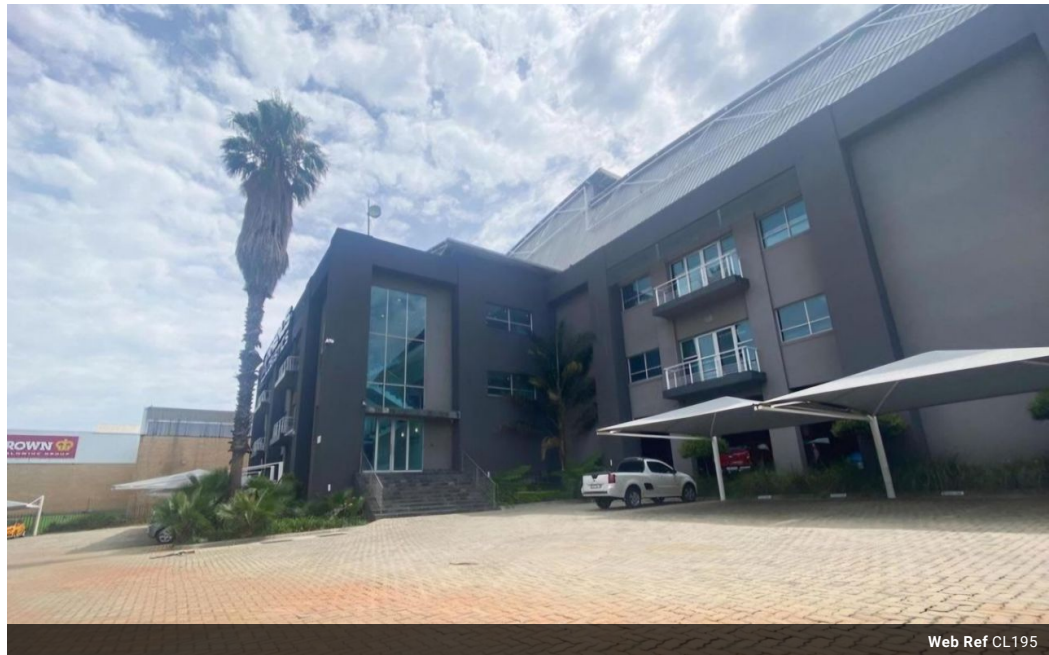
Web Ref CL195

Ground Floor The Place 1 Sandton Drive Sandton 2196