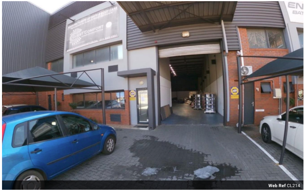
Web Ref CL214

Ground Floor The Place 1 Sandton Drive Sandton 2196