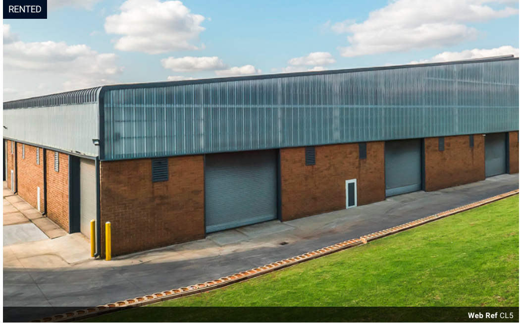
Web Ref CL5

Ground Floor The Place 1 Sandton Drive Sandton 2196