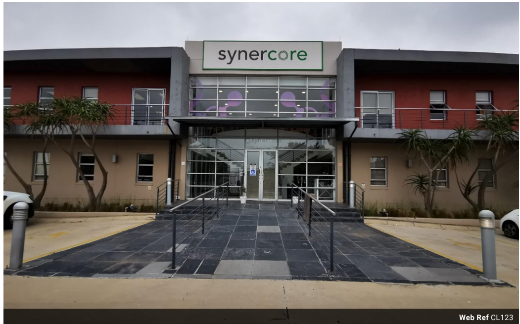
Web Ref CL123

Ground Floor The Place 1 Sandton Drive Sandton 2196