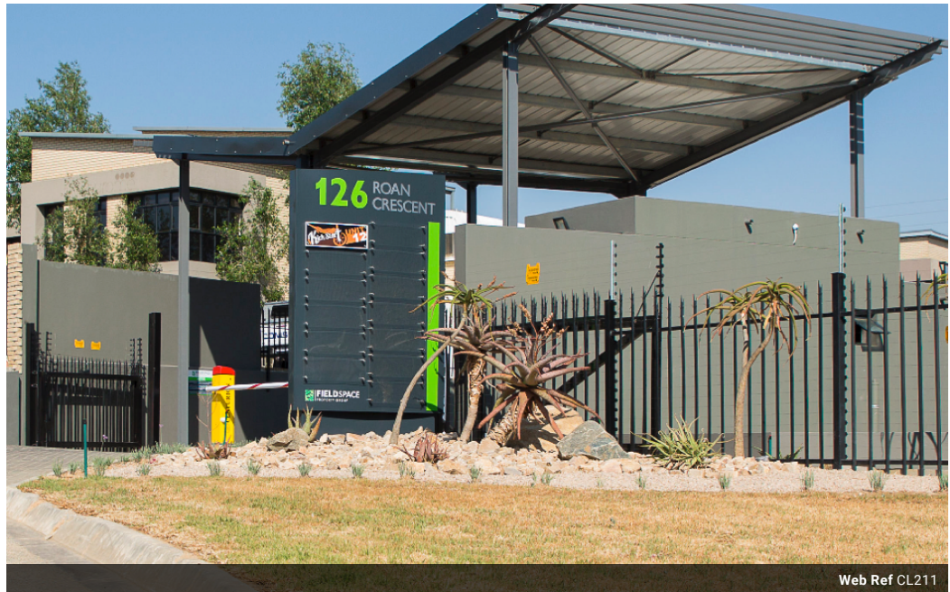
Web Ref CL211

Ground Floor The Place 1 Sandton Drive Sandton 2196