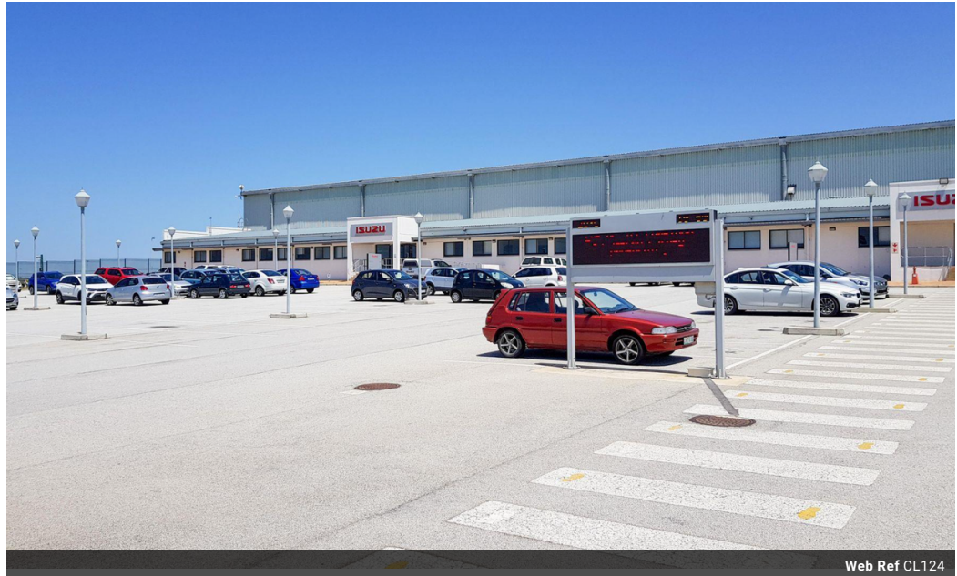
Web Ref CL124

Ground Floor The Place 1 Sandton Drive Sandton 2196