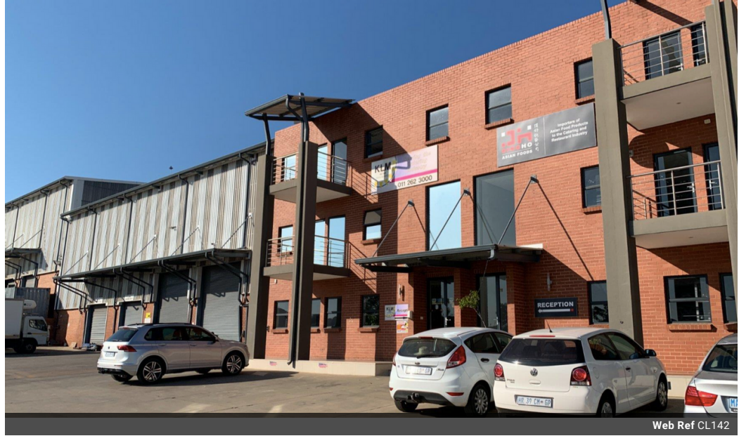
Web Ref CL142

Ground Floor The Place 1 Sandton Drive Sandton 2196